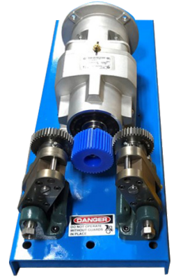
Single Motor 2K (available up to 12K)