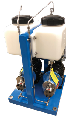
2K Series Stainless Steel B9000MD Series for Mixing Isocyanates and Polyols