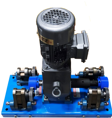
Single motor 4K

The foam and adhesives industry relies heavily on precision and efficiency, and CIRCOR'S ZENITH PRECISION GEAR METERING PUMPS are engineered to deliver just that. No one has more experience or material options for dispensing/dosing sealants and adhesives than Zenith.